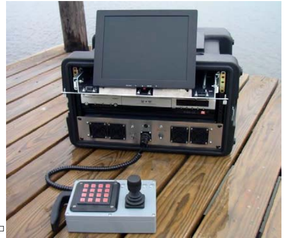
(500 FT. MAX.) CABLE